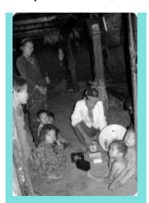
Figure 4: Early morning battery charging in Raje Danda.

Late into our scheduling period Fate again seemed to influence our plans with the discovery that there was an experimental 200 Watt Pico Hydro Generator (PHG) operating in the village of Thalpi in the remote northwest Jumla district. On investigation it was also discovered that it powered only three homes fitted with incandescent bulbs. An offer was made to the village elders, and accepted, that we wire the entire village of 28 homes with 220 V AC, convert it to 12 V DC and then equip each home with two WLED lamps.