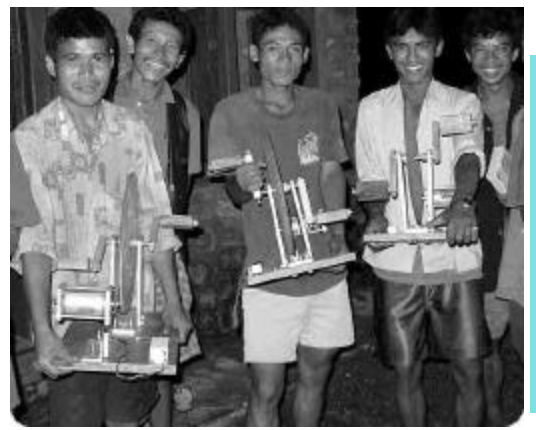
Figure 5: The proud custodians of the Thulo Pokhara Pedal Generators about to take them home.

the power source already existed and was reasonably well regulated so all that was required was a dependable 220 V AC to 12 V DC converter [5]. The villagers dug all the trenches, laid all the plastic pipes to protect the electrical wiring between the generator and the village and wired their own homes.