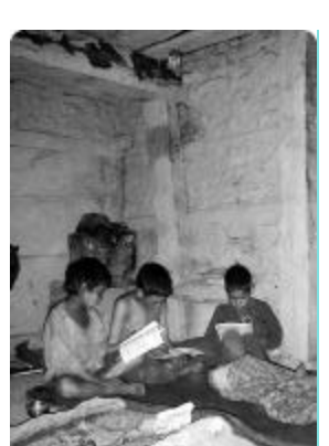
Figure 3: Three older children studying with the light of their 6WLED lamp in Thalpi. The light is seen fixed on the ceiling at the top of the photo.

In collaboration with Mike Rojik, Director of the Nepal School Projects (NSP) [3], a Canadian-Nepali NGO, several villages were selected for a trial of the innovative new WLED system developed at the University of Calgary. Extensive lab and field-testing of the WLED lamps and Pedal Generators proved that they were a viable and possible alternative for the villages, located south east of the capital Kathmandu (Figure