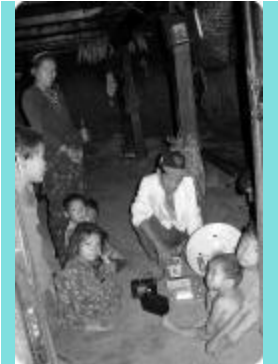
Figure 4: Early morning battery charging in Raje Danda.

Late into our scheduling period Fate again seemed to influence our plans with the discovery that there was an experimental 200 Watt Pico Hydro Generator (PHG) operating in the village of Thalpi in the remote northwest Jumla district. On investigation it was also discovered that it powered only three homes fitted with incandescent bulbs. An offer was made to the village elders, and accepted, that we wire the entire village of 28 homes with 220 V AC, convert it to 12 V DC and then equip each home with two WLED lamps.