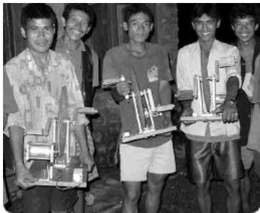
Figure 5: The proud custodians of the Thulo Pokhara Pedal Generators about to take them home.

the power source already existed and was reasonably well regulated so all that was required was a dependable 220 V AC to 12 V DC converter [5]. The villagers dug all the trenches, laid all the plastic pipes to protect the electrical wiring between the generator and the village and wired their own homes.