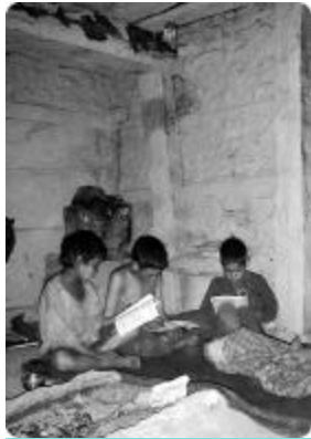
Figure 3: Three older children studying with the light of their 6WLED lamp in Thalpi. The light is seen fixed on the ceiling at the top of the photo.

In collaboration with Mike Rojik, Director of the Nepal School Projects (NSP) [3], a Canadian-Nepali NGO, several villages were selected for a trial of the innovative new WLED system developed at the University of Calgary. Extensive lab and field-testing of the WLED lamps and Pedal Generators proved that they were a viable and possible alternative for the villages, located south east of the capital Kathmandu (Figure 3).