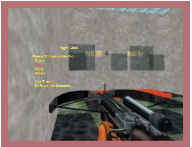
Figure 3: "cut" is selected from the right-click menu.