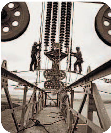
Figure 1: Attachment of 735 kV power lines to insulators with the aid of a crane. The first-ever lines of this type linked the Manic-Outardes generating stations to the metropolitan areas of Québec City and Montréal.

In August 1962, Hydro-Québec decided to take on this technical challenge and proceed with the construction, within 3 years, of the first phase of this innovative project: the line from Manic to Boucherville sub-station in the South of Montreal. Industry and consultants mobilized to tackle this, one of the world's largest construction projects.