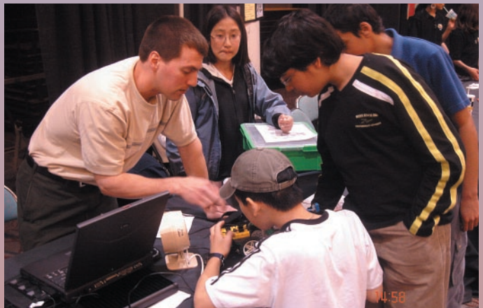
The Bondar Bots team gathers around their design table to make some last-minute adjustments in preparation of their quarterfinal matchup against Katimavik Public School’s Error404s , the eventual overall winners of the senior challenge.