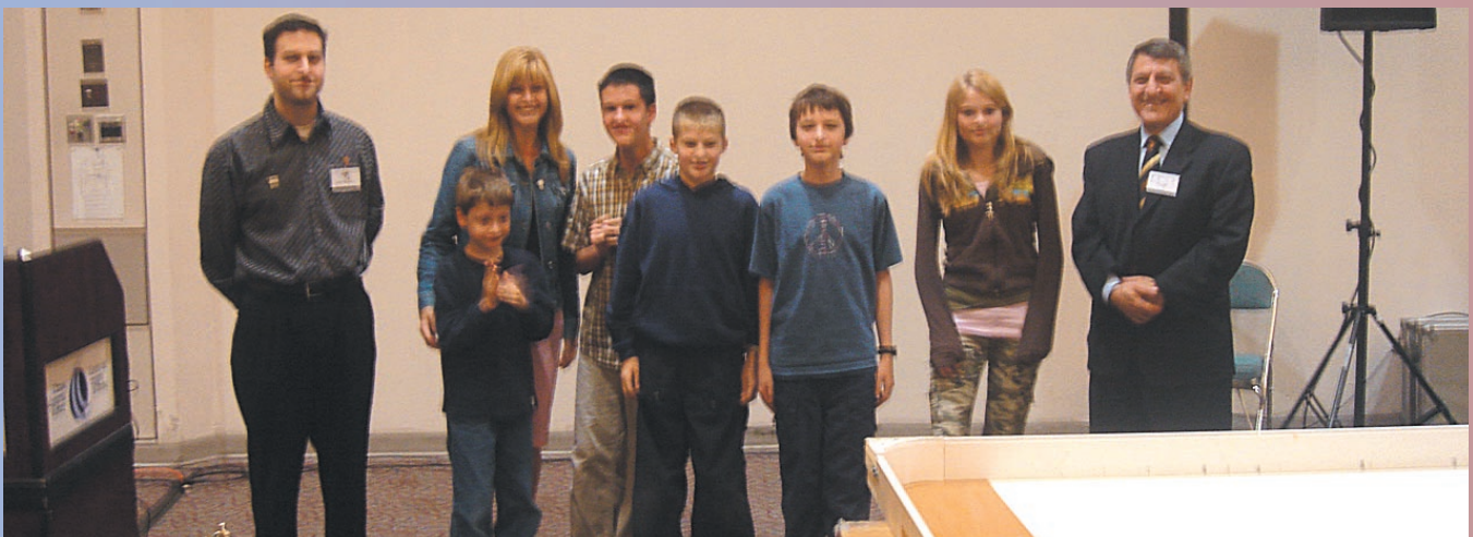
Goulbourn Middle School's junior level team, a bit tired after an exciting but long day, took home the Technical Innovation award for their entry Linebot 3 . Watch out for them next year!