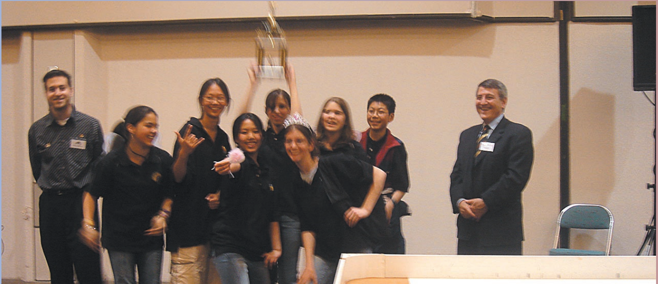
The Katimavik Elementary School team's spirit almost reaches the ceiling as they pose (very briefly) with their trophy as senior challenge overall winners. They dubbed their entry " Error 404 ", a name only this generation of aspiring engineers could select.