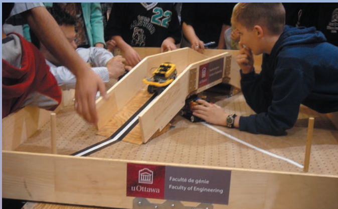
The Goulbourn Middle School’s Linebot3 team calibrates their light sensor in preparation of their timed run through the junior challenge. The junior teams found out that the shadow under the bridge needed to be accounted for, as it differed from the values they obtained with their own school mockups.